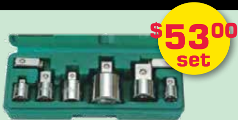
8 Piece 1/4" To 3/4" Chrome Adaptor Set 9608