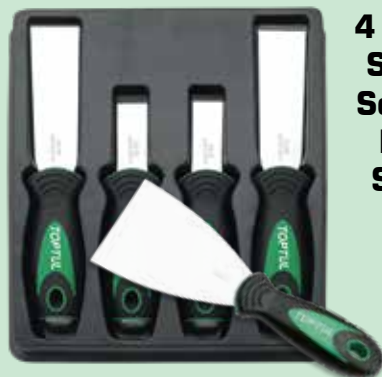
4 Piece Stainless Steel Pinch Weld Scraper Set with Bonus 100mm Stainless Steel Putty Knife JGAT0401-Bonus